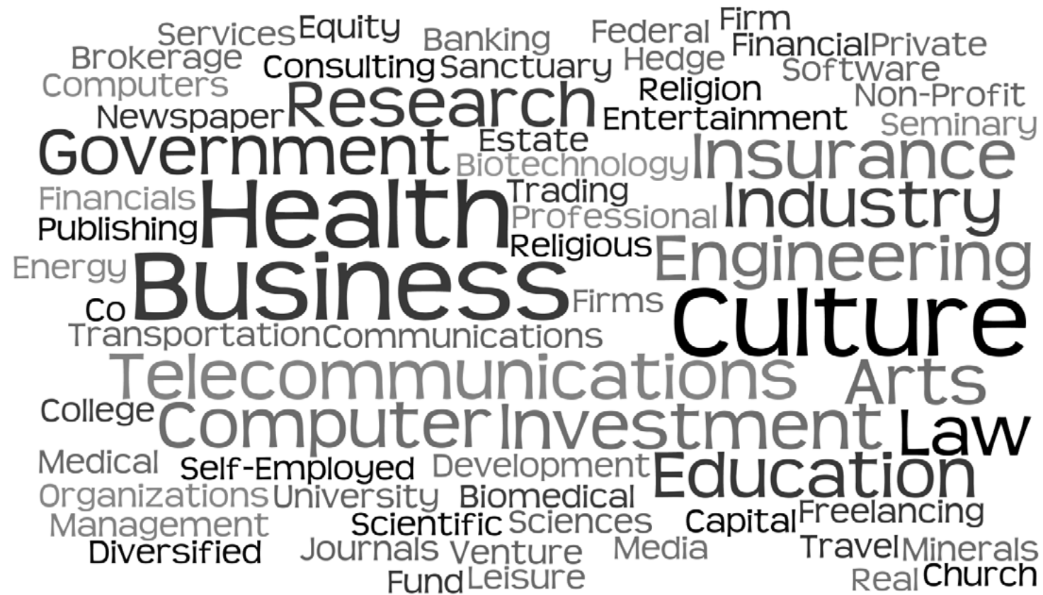
Figure 2: Fields in which alumni since 1984 can now be found.