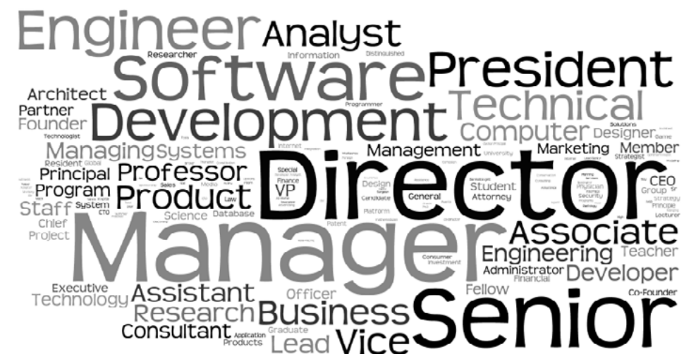
Figure 1: Titles that alumni since 1984 now hold.

If you intend to concentrate in CS, you should take CS50 for a letter grade. But should you decide to concentrate in CS only after taking CS50, a SAT in CS50 would count for concentration credit.