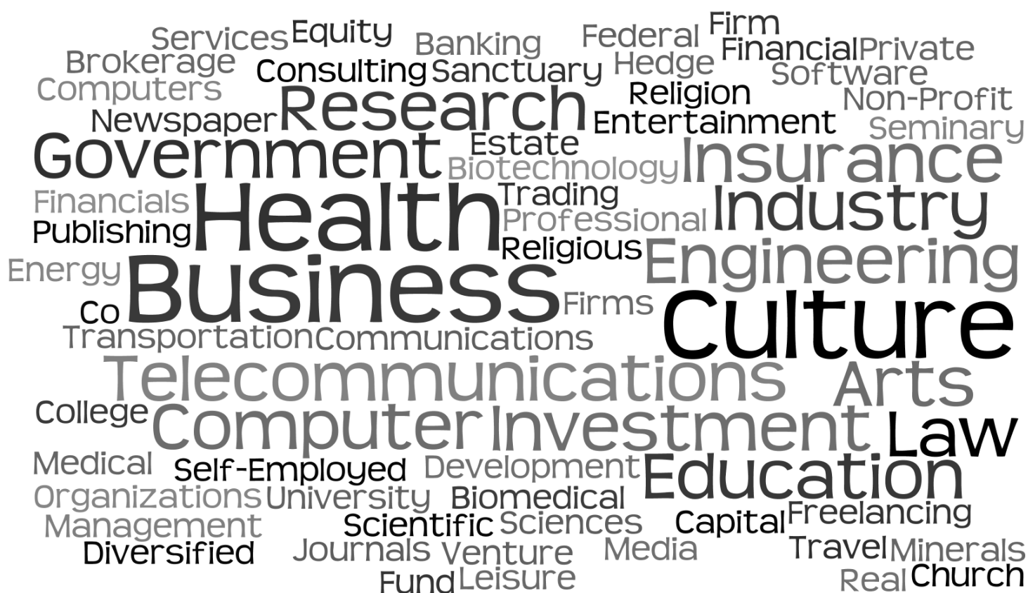
Figure 2: Fields in which alumni since 1984 can now be found.