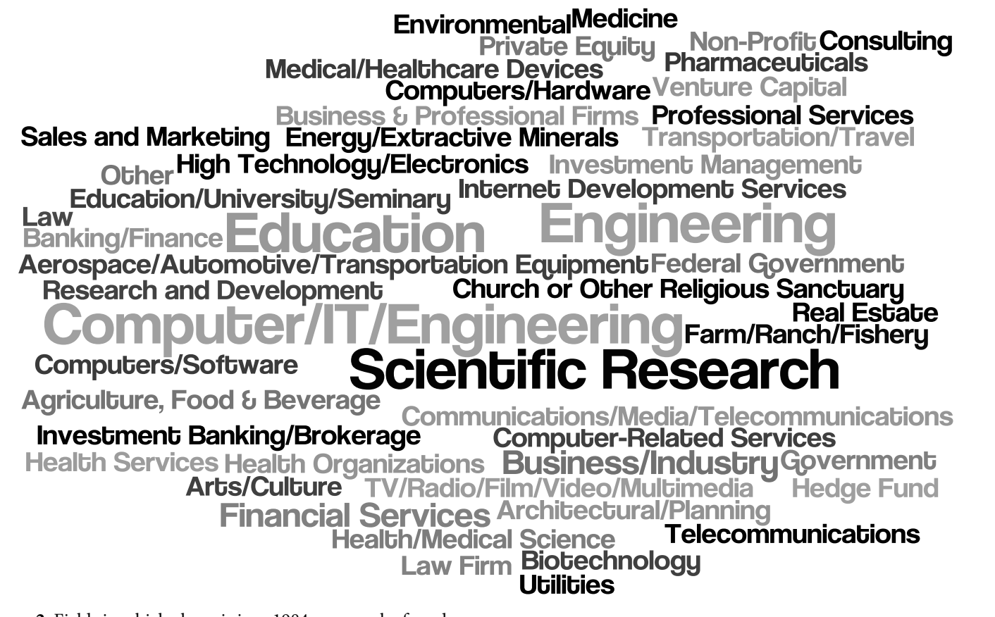
Figure 2: Fields in which alumni since 1984 can now be found.