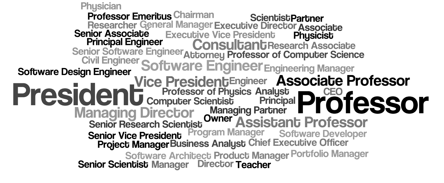
Figure 1: Titles that alumni since 1984 now hold.

Yes, a SAT in CS50 would count toward concentration or secondary credit.