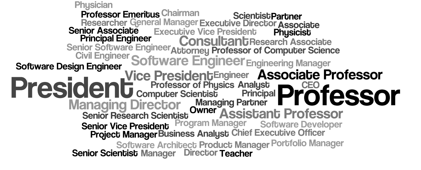
Figure 1: Titles that alumni since 1984 now hold.

Yes, a SAT in CS50 would count toward concentration or secondary credit.