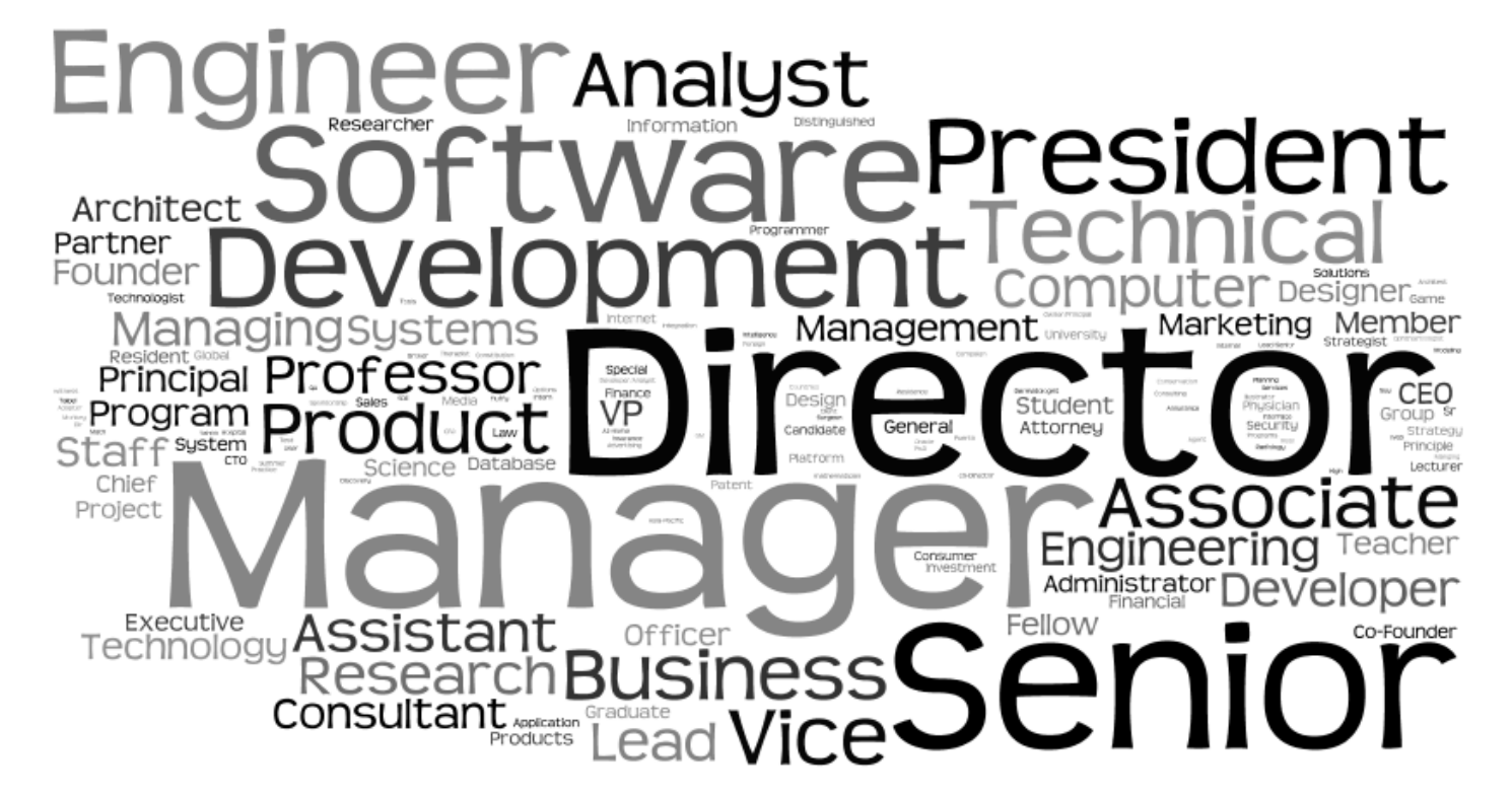
Figure 1: Titles that alumni since 1984 now hold.

Yes, but you probably shouldn't. Joint concentrations are really for students who want to write a thesis on some research problem in the intersection of two fields. If you simply want to study both fields, it's generally best to get a secondary or simply take courses in CS or the other field.