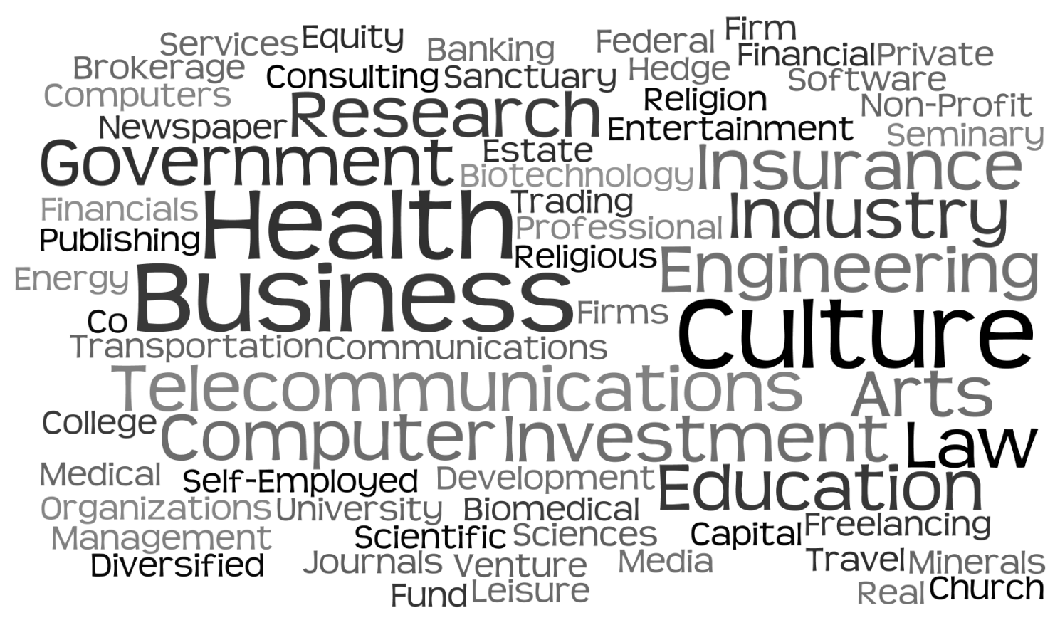
Figure 2: Fields in which alumni since 1984 can now be found.