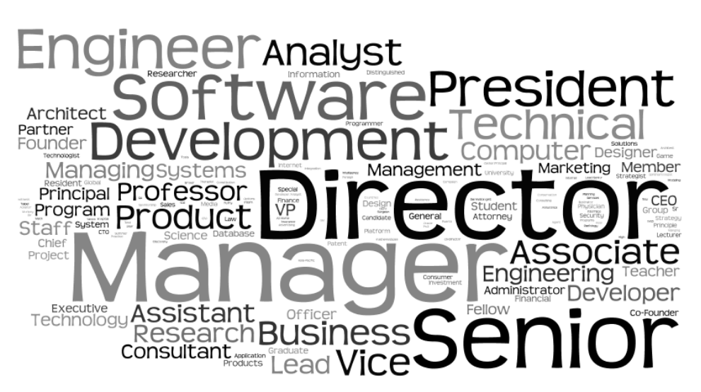
Figure 1: Titles that alumni since 1984 now hold.

If you intend to concentrate in or do a secondary in CS, you should take CS50 for a letter grade. But should you decide to concentrate in or do a secondary in CS only after taking CS50, a SAT in CS50 would count for concentration or secondary credit.