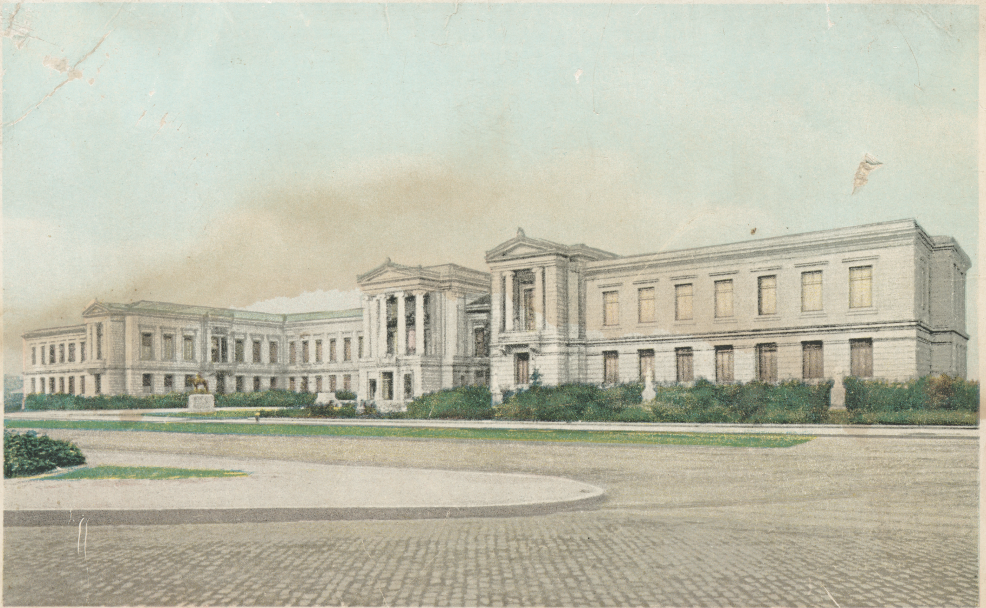
71541 MUSEUM OF FINE ARTS, BOSTON, MASS.