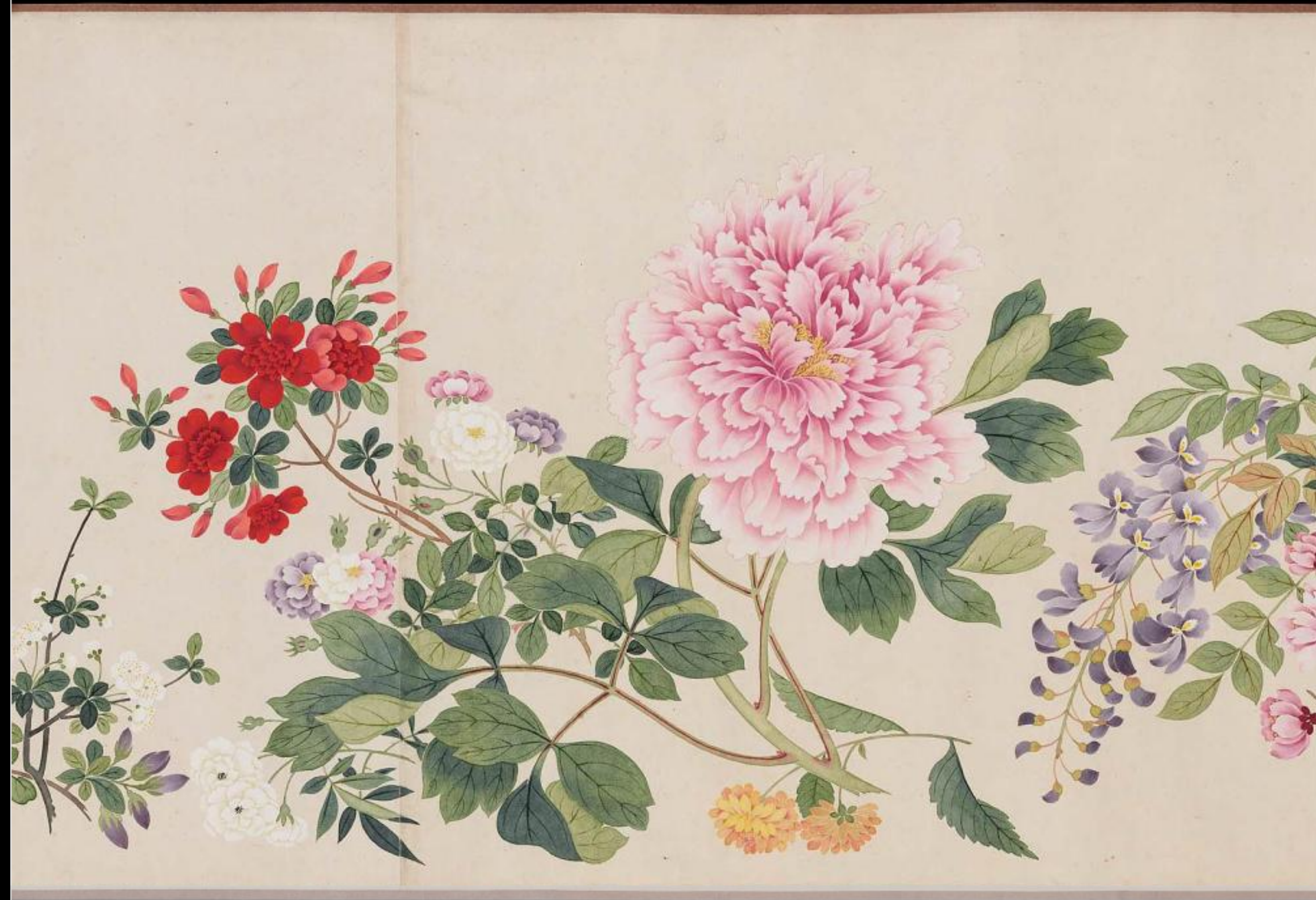
Profusion of flowers