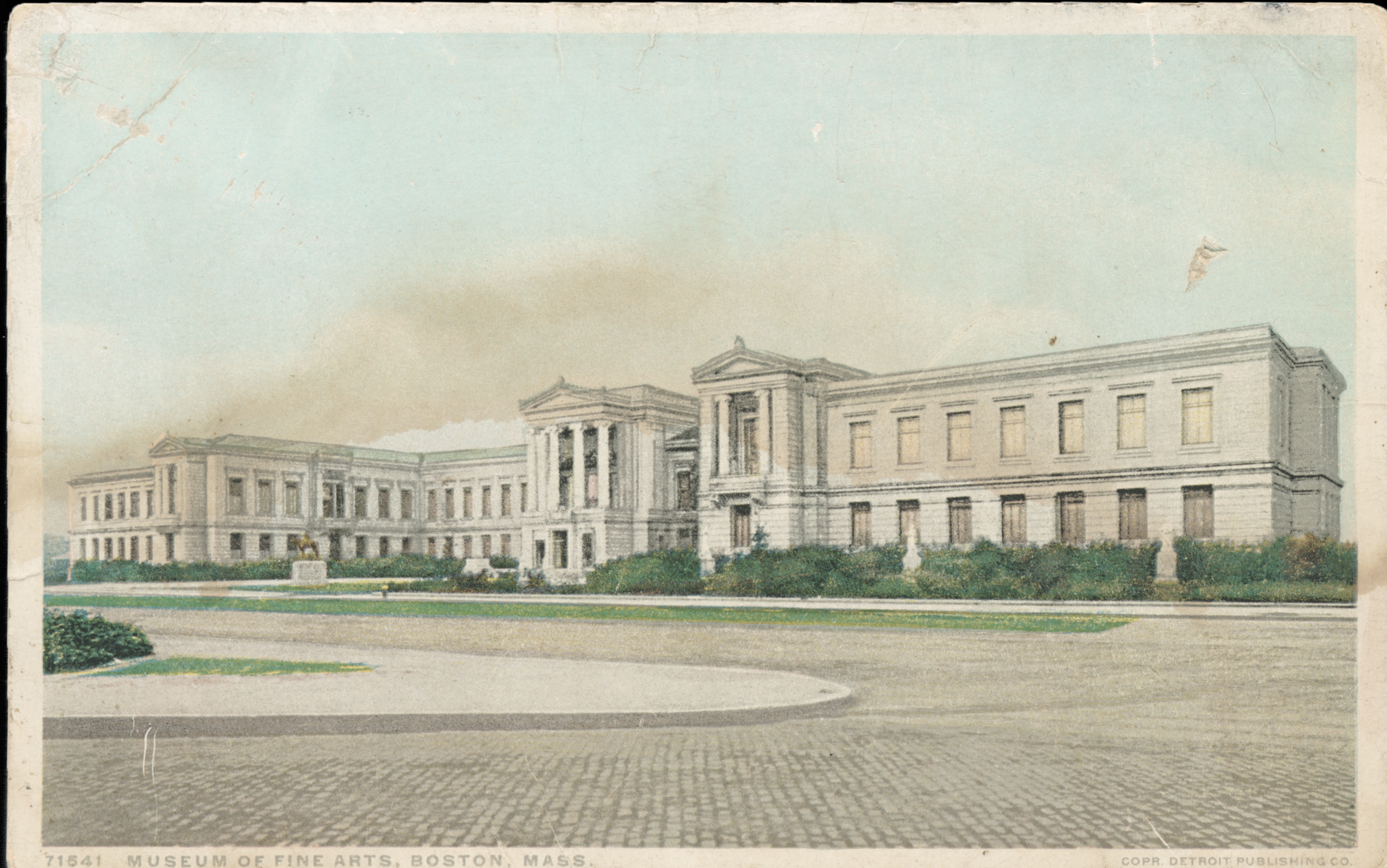
71541 MUSEUM OF FINE ARTS, BOSTON, MASS.