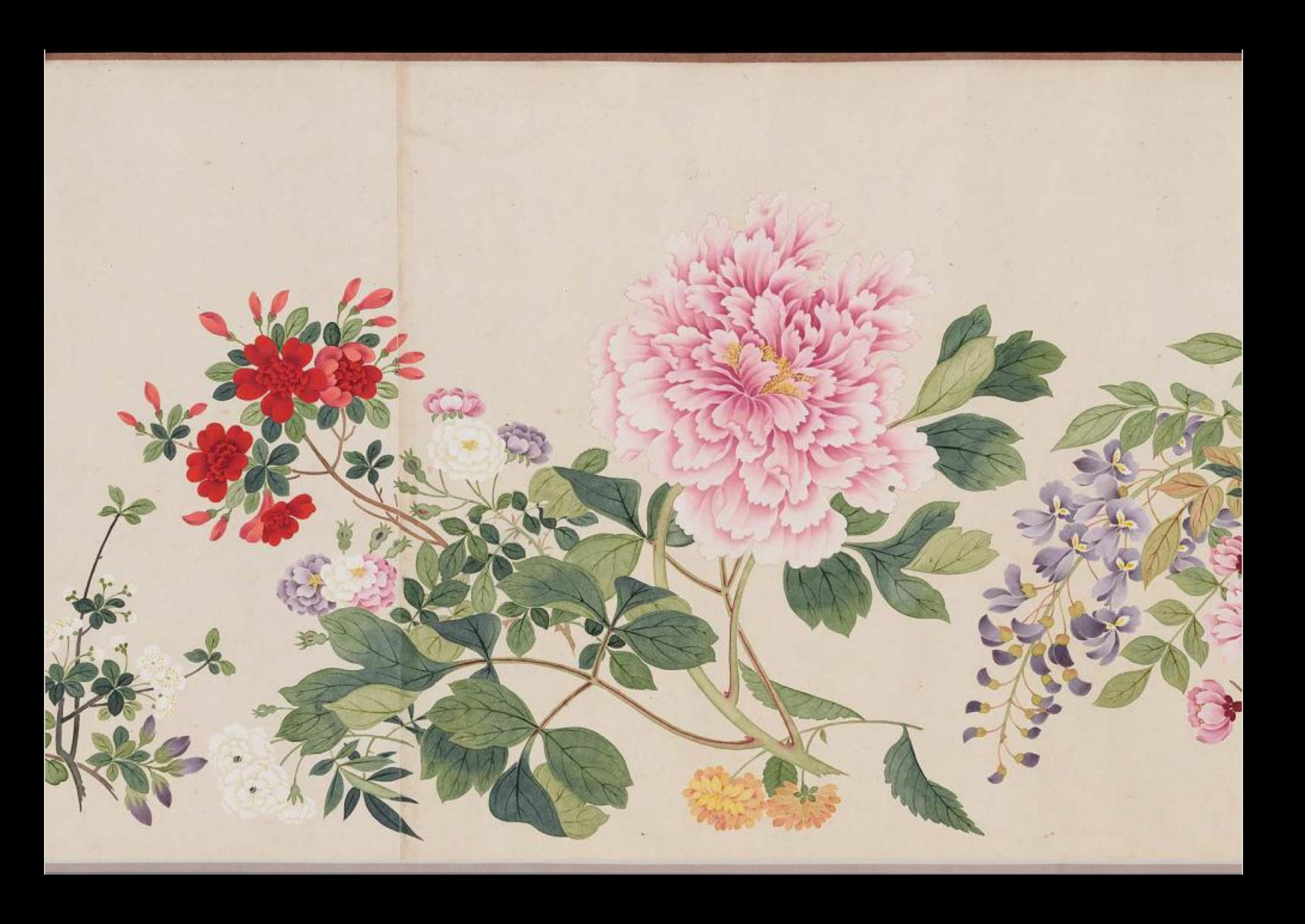
Profusion of flowers