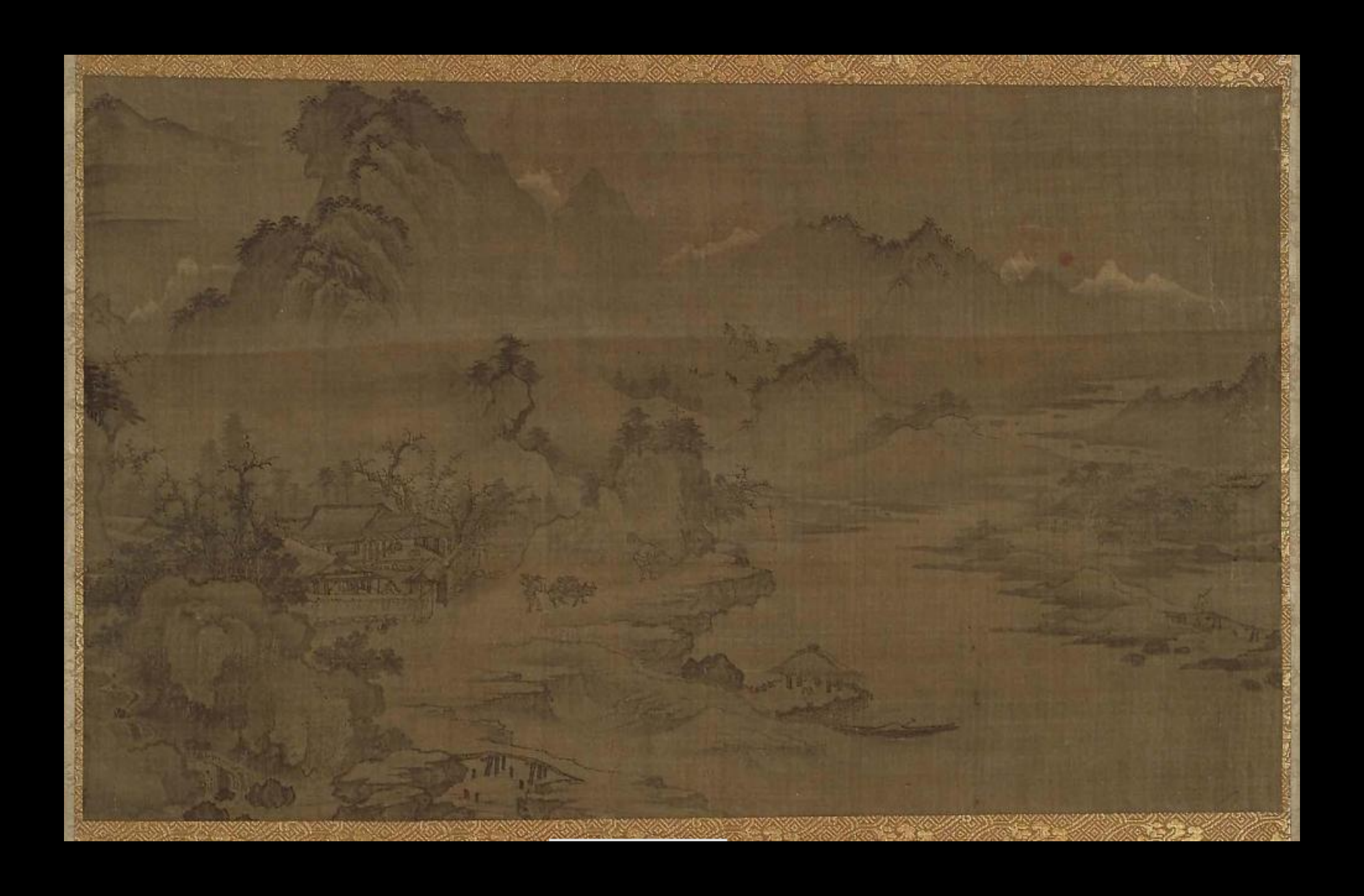
Farmers working at dawn